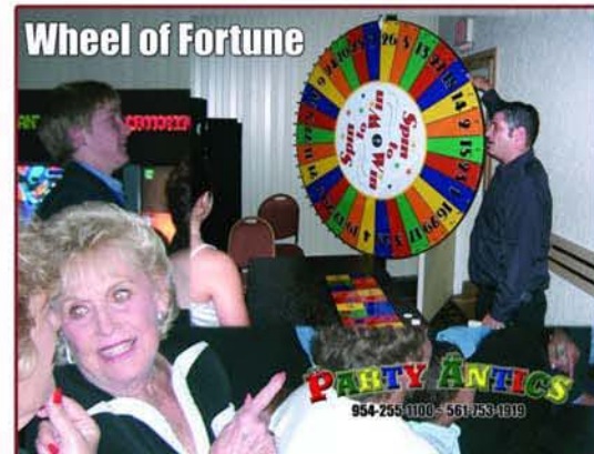
Wheel of Fortune