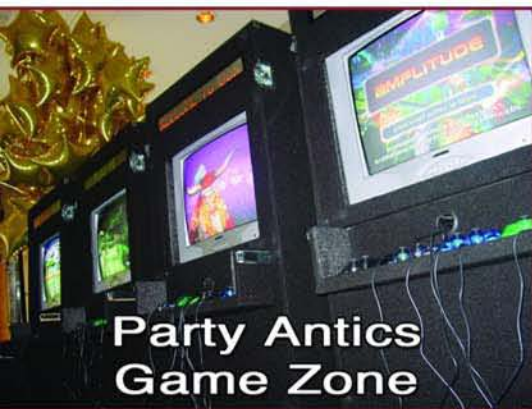
Party Antics Game Zone